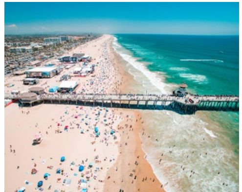
Huntington Beach Pier