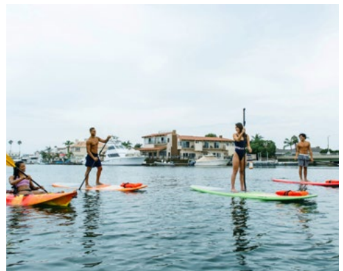
McKinnon Surf & SUP Lessons